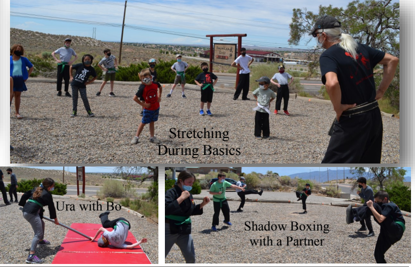
We do lots of Weapons Training Outdoors. Here students practice Attack and Response drills with swords.