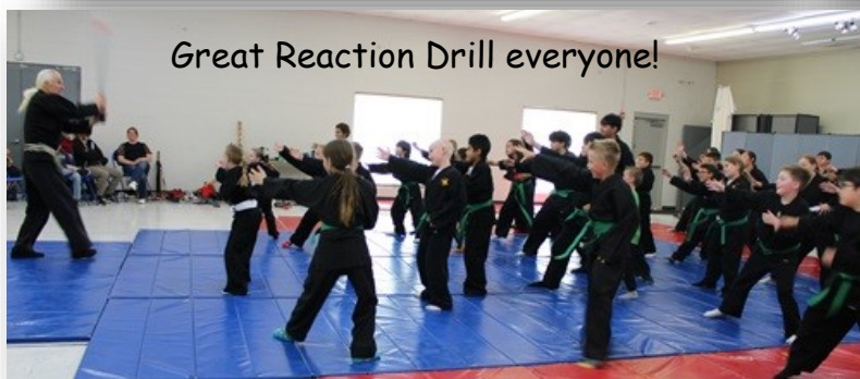
Great Reaction Drill everyone!