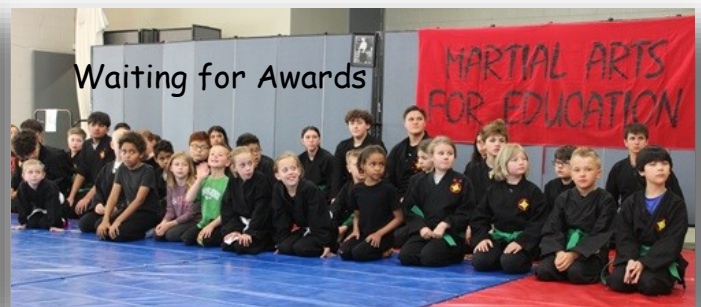
Waiting for Awards