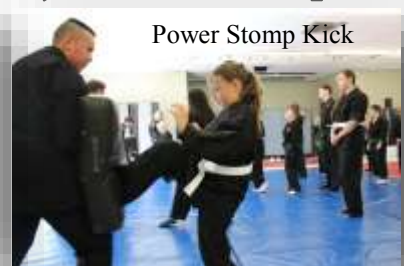
Power Stomp Kick