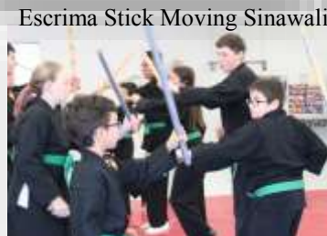
Escrima Stick Moving Sinawali