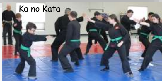
Ka no Kata

Left & Right: San Shin no Kata Below Left: Ushiro Ukemi