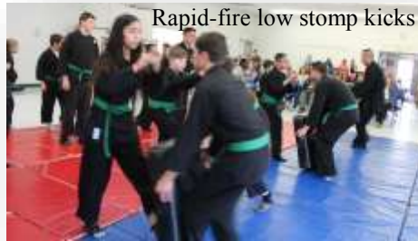
Rapid-fire low stomp kicks