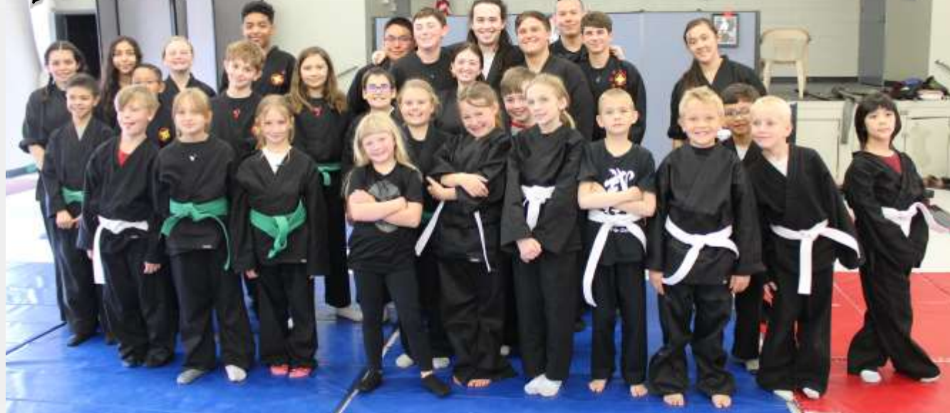
Chi no Kata