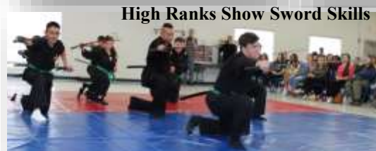
High Ranks Show Sword Skills