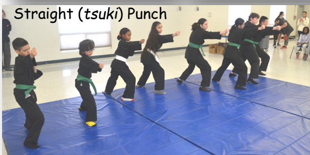
Straight (tsuki) Punch