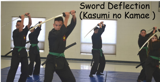
Sword Deflection (Kasumi no Kamae)