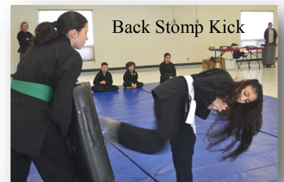
Back Stomp Kick