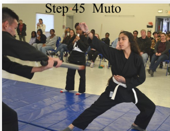
Step 45 Muto